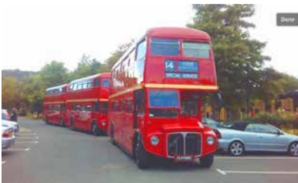
Three bus cortege at Bramcote Crematorium